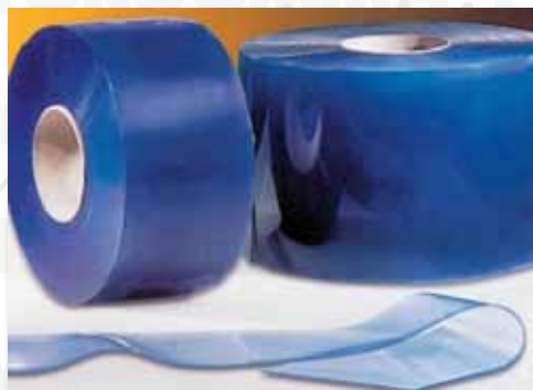
PVC TRASPARENTE FLESSIBILE FLEXIBLE TRANSPARENT PVC