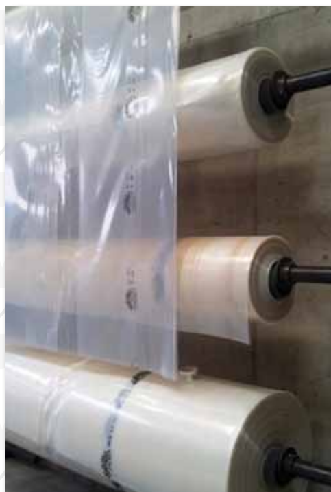
TELONE POLITENE POLYETHYLENE BLOWN FILM