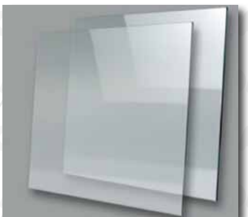
POLICARBONATO COMPATTO POLYCARBONATE

Misure e spessori a richiesta. Sizes and thickness on request.