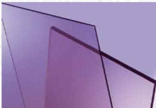
LASTRE PVC TRASPARENTE TRANSPARENT PVC SHEETS