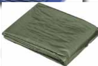
TELONE RAFIA MULTIUSO SHEETS MULTIPURPOSE